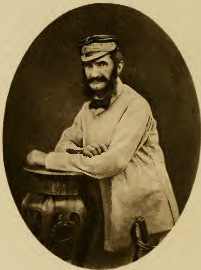
Major General Sir J. Hope Grant, K.C.B.